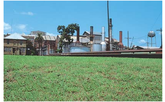
The Sterling Sugar Refinery processes sugar cane during a 3-4 month harvesting season

The paver contractor for the project was Kellystone of Austin, Texas, who also reinstalled the pavers after repairs were made to the water main. The pavers were installed over a 1" bedding course of washed concrete sand conforming to the grading requirements of ASTM C33.