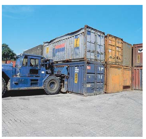
Sterling Sugar container handlers can weigh up to 160,000 lb when fully loaded

Just two weeks into production, there was a water main leak under a 10 to 20-ft wide section of the UNI-Anchorlock® pavement that extended almost the entire length of the facility. Even with the damage to the underlying soils, the pavement was capable of supporting heavy vehicular loads until repairs could be made during the offseason - three months later.