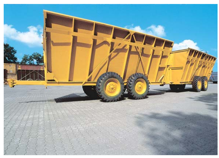
Tractor-pulled cane trailers are used to transport raw cane to the facility

Bayou Sále installed a 16" Fluorlite base (a high-calcium by-product of Freon, supplied by a local producer) over a 4" subbase of 6/10 limestone. One foot of the existing subgrade (5' of clay over a silty clay) was compacted to 95% Standard Proctor.