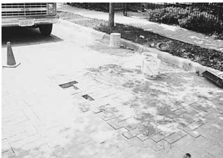
Figure 4. Reinstatement of the pavers, bedding and joint sand