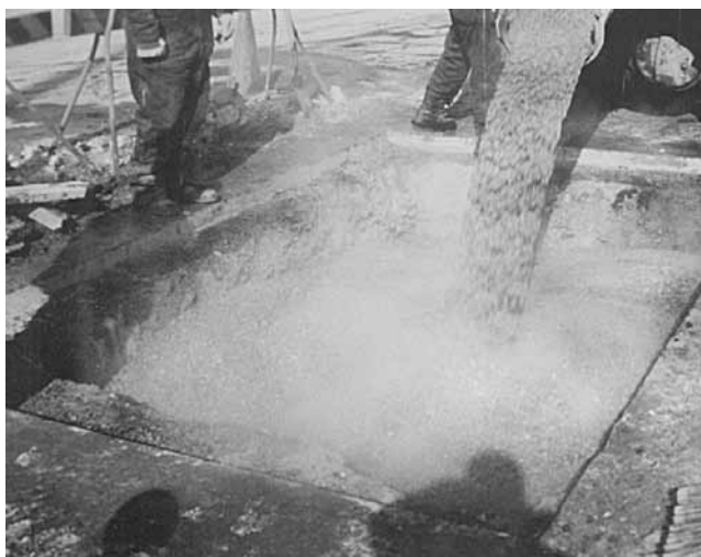
Figure 11. Low density concrete fill (unshrinkable fill) poured into a utility trench from a ready-mix concrete truck.

low maximum cement content and strength enables the material to be excavated in the future. Mixes containing supplementary cementing materials should be evaluated for excessive strength after 28 days.