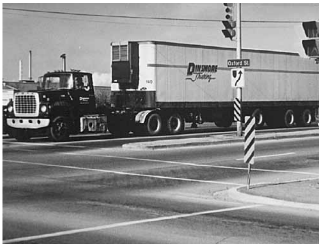
Figure 10. A patch of barely discernable pavers in a heavily trafficked intersection in London, Ontario

A strength of 10 psi (0.07 Mpa) should be achieved within 24 hours. The maximum 28 day compressive strength should not exceed 50 psi (0.4 Mpa) as measured by ASTM C 39 (11) or CAN3-A23.2-9C (10). Cement content should be no greater than 42 lbs/cy (25 kg/m 3 ). The