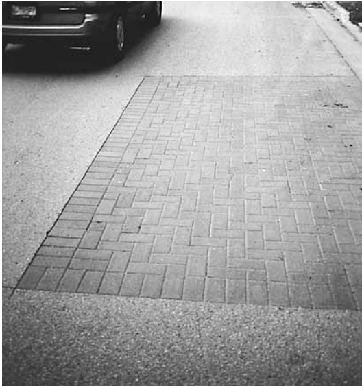
Figure 8. Utility cut repair in a residential area in London, Ontario.