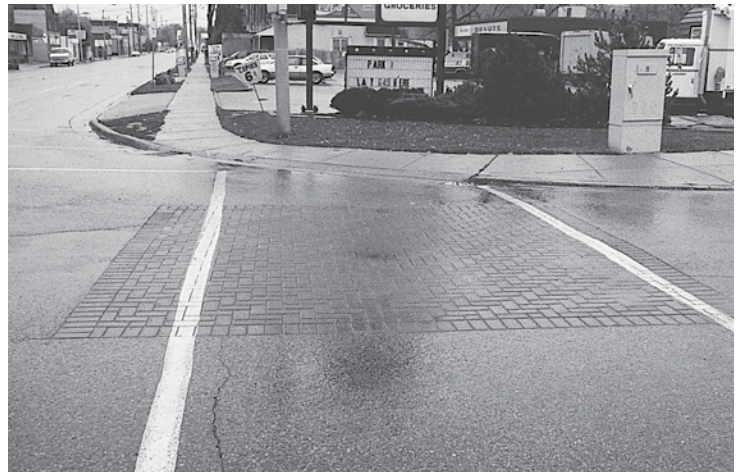
Figure 13. Concrete pavers in utility cuts can be painted as any other pavement.

other debris. The pavers may be painted with the same lane, traffic, or crosswalk markings as any other concrete pavements (Figure 13).