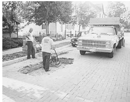
Figure 3. Compaction of the base