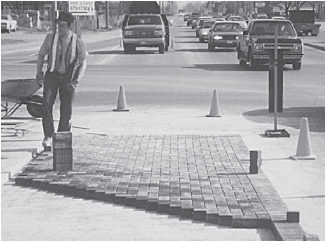
Figure 12. Pavers are laid in a 90 degree herringbone pattern between the border courses.