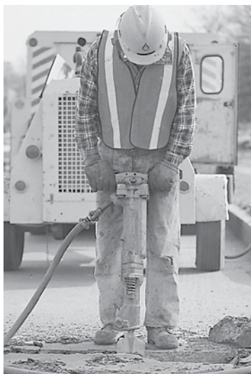
Figure 1. Repairs to utilities are a common sight in cities, incurring costs to cities and taxpayers.

The annual cost of utility cuts to cities is in the millions of dollars. These costs can be placed into three categories. First, there are the initial pavement cut and repair costs .