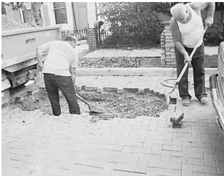
Figure 2. Removal of concrete pavers for a gas line repair in Dayton, Ohio.

Reducing User Costs— User costs due to traffic interruptions and delays