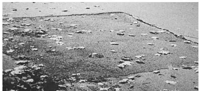
Figure 7. Pavement damage from settlement and shrinkage of cold patch asphalt.

Concrete pavers on low density concrete fill have been successfully used as a replacement for cold patch asphalt (Figures 8 and 9). They were first used as a temporary repair with the intent of being removed in the spring. However, the pavers performed so well that the City of London left them in place indefinitely. Several repairs were in streets subject to heavy truck traffic, as well as residential streets. Costs were less than using cold