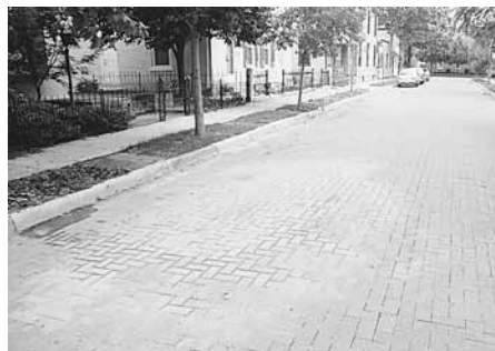
Figure 5. The final paver surface is continuous. There are no cuts or damage to the pavement.