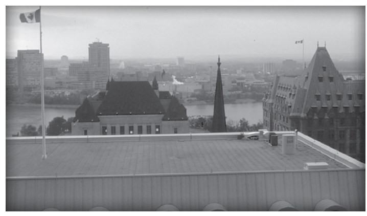
Figure 5. Light colored paving on low-slope roofs reflects light saving on air-conditioning costs while protecting the waterproofing.

out the life cycle of the project. An increasing number of jurisdictions are beginning to require the use of cool roofs on new building projects.