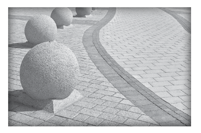
Figure 4. Light colored paving units reflect light and help reduce mico-climatic temperatures.

Grid pavement-LEED® defines open-grid pavement as having less than 50% imperviousness. This includes concrete grid pavements with grass.