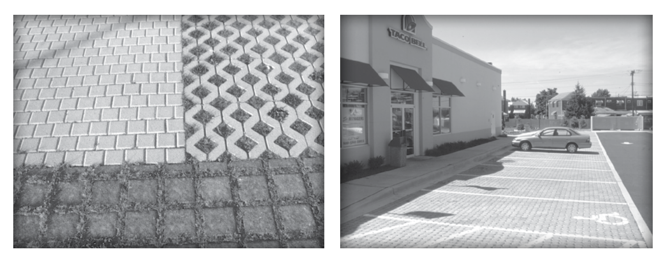
Figure 1. Sustainability for buildings extends to the site with sustainable paving that promotes infiltration and reflects radiant heat from sunlight.

LEED<sup>®</sup> establishes a consensus-based means for measuring building and site performance. It promotes designs that integrate energy and resource conservation. LEED<sup>®</sup> is being applied to many publicly funded projects and a growing number of private ones. A primary objective of LEED<sup>®</sup> is to help facility owners reduce maintenance and life-cycle costs. This is accomplished by including all players in an integrated development process during the design stages of a project.