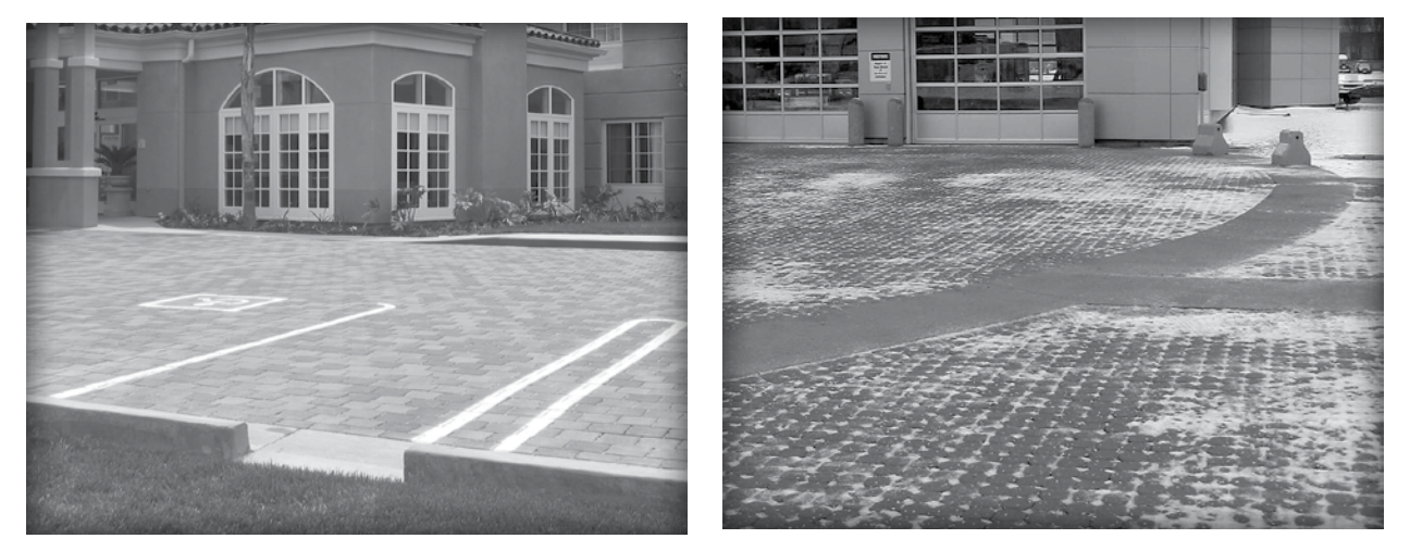
Figure 2. Examples of permeable interlocking concrete pavements for earning LEED<sup>®</sup> points. The photo on the left shows a hotel entrance in southern California. The photo on the right shows the driveway and parking lot for a fire station in Toronto.

According to Ferguson (2005), the runoff coefficient, C used in the rational method, will vary with each storm. For small storms permeable pavements will infiltrate all of the rainfall rendering a low runoff coefficient. In intense storms, and when the soil is saturated from antecedent storms, the runoff coefficient will be higher. Since most sites are exposed to a range of storm intensities and durations, the overall runoff coefficient of 0.25 to 0.35 can be assumed for PICP. This is a conservative estimate.