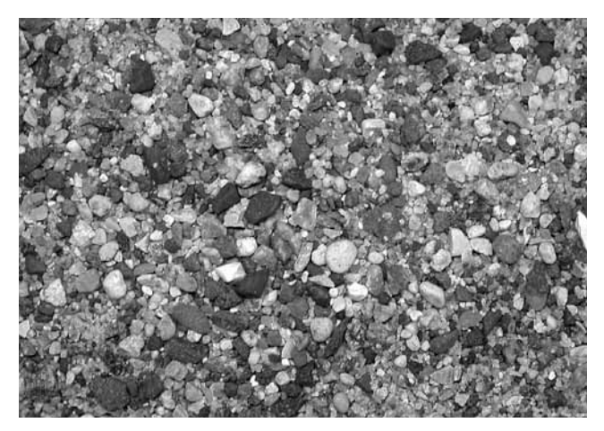
Figure 3. Example of sand from the ICPI bedding sand test program with a total combined percentage of subangular and sub-rounded particles equal to 65% according to ASTM D 2488

Limestone screenings and stone dust are not recommended for bedding sand. In addition to being unevenly graded and having excessive material passing the No. 200 (0.075 mm) sieve, screenings and stone dust will break down over time from wetting and abrasion due to vehicular loads. Unlike soft limestone screenings and stone dust, hard, durable concrete sand meeting the requirements in Table 3 will not break down easily. Limestone screenings also tend to break down during pavement construction under initial paver compaction. Depressions will eventually appear in the pavement surface with limestone screenings or stone dust.