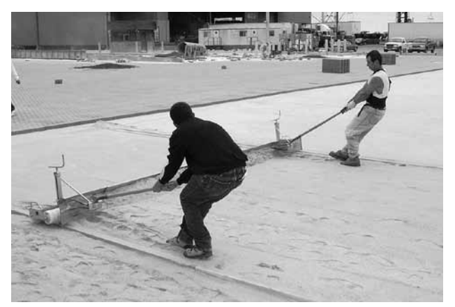
Figure 4. A two-man hand pulled screed