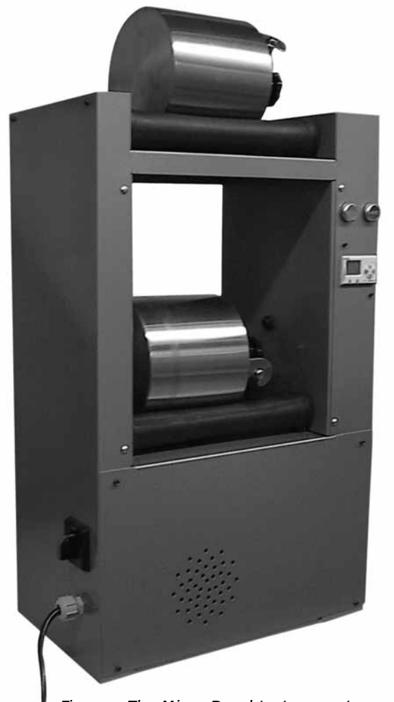
Figure 1. The Micro-Deval test apparatus.

Failure of the bedding sand layer occurs in channelized vehicular loads from two main actions; structural failure through degradation and saturation due to inadequate drainage. Since bedding sands are located high in the pavement structure, they are subjected to repeated