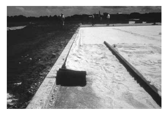
Figure 7. Woven geotextile used to contain bedding sand from migrating laterally. Visit www.icpi.org for detail drawings.

The sand should have sufficient moisture content to allow for adequate compaction. At no times should bedding sand be either "bone dry" or saturated. A moisture content range of 6% to 8% has been shown to be optimal for most sands (Beaty 1992). Contractors can assess moisture content by squeezing a handful of sand in their hand. Sand at optimal moisture content will hold together when the hand is re-opened without shedding excess water. Although it can be difficult to control the exact moisture content on the job site, uniformity of moisture content can be maintained by covering stock piles with tarps. Digging into sand piles at mid-height to avoid saturated material that may be at the bottom of the pile is also recommended.