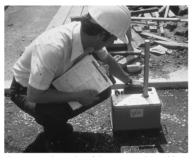
Figure 5. Density testing of the aggregate base with a nuclear density gauge.

Edge restraints must be set at the correct level, especially if the tops of the restraints are used for screeding the bedding sand. Their elevations should be checked prior to placing the sand and pavers. Edge restraints are typically installed before the bedding sand and pavers are laid. However, some restraints can be secured into the base as the laying progresses.