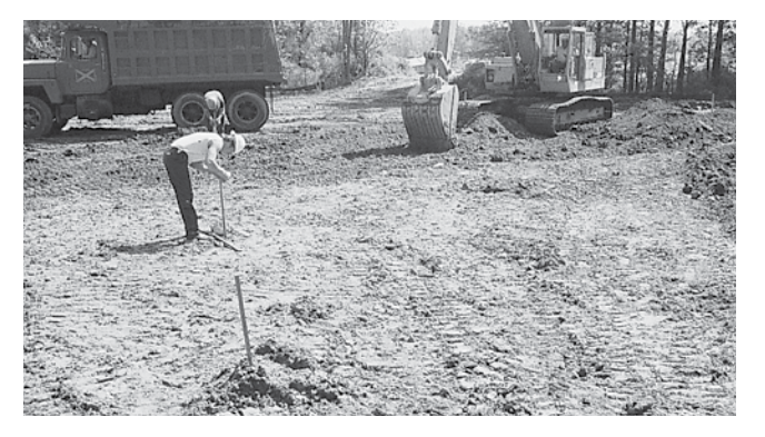
Figure 1. Excavation of the soil subgrade.

Prior to excavating, check with the local utility companies to ensure that digging does not damage underground pipes or wires. Many localities have one telephone number to call at least two days before excavation for marking utility line locations. Overhead clearances should be checked so that equipment does not interfere with wires. Site access by vehicles and equipment should be established so that the job can be built without delays.