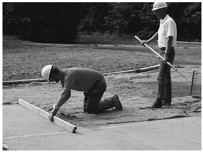
Figure 6. Screeding the bedding sand.