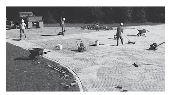
Figure 12. Excess sand swept from the finished surface will make the pavement ready for traffic.

ding sand is then removed. The remaining uncompacted edge can be covered with a waterproof covering if there is a threat of rain. This will prevent saturation of the bedding sand, minimizing removal and replacement of the bedding sand and pavers.