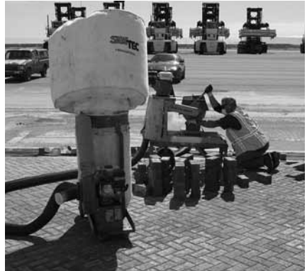
Figure 8. Saw cutting pavers.

being swept and compacted into the joints. Joint sand may be finer than the bedding sand to facilitate filling of the joints. Bedding sand also can be used to fill the joints, but it may require extra effort in sweeping and compacting. Compaction should be within 6 ft (2 m) of an unrestrained edge or laying face. All pavers within 6 ft (2 m) of the laying face should have the joints filled and be compacted at the end of each day. Excess bed-