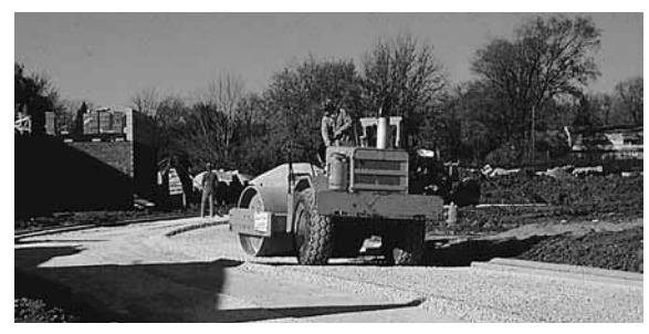
Figure 4. Base compaction with a vibratory roller.

Sidewalks, patios and pedestrian areas should have a minimum base thickness (after compaction) of 4 in. (100 mm) over well-drained soils. Residential driveways on well-drained soils should be at least 6 in. (150 mm) thick. In colder climates, continually wet or weak soils will require that bases be at least 2 to 4 in. (50 to 100 mm) thicker.