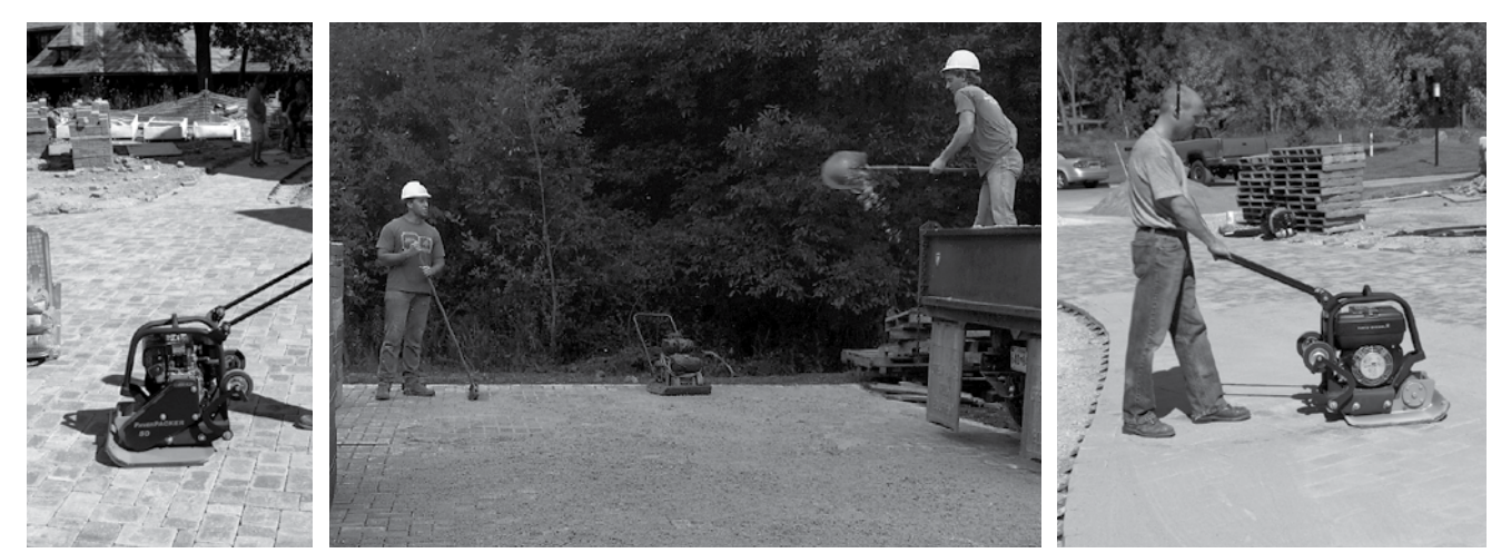
Figure 9. Compacting the pavers and bedding sand.