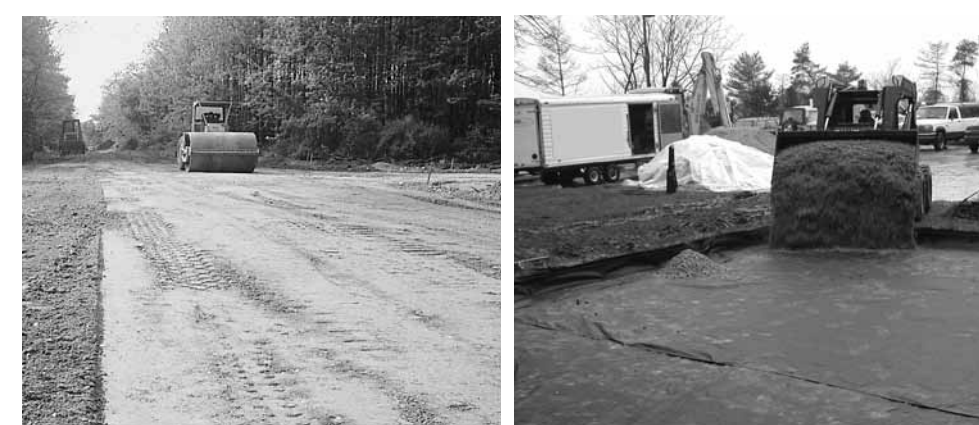
Figure 2. Compacting the soil subgrade.